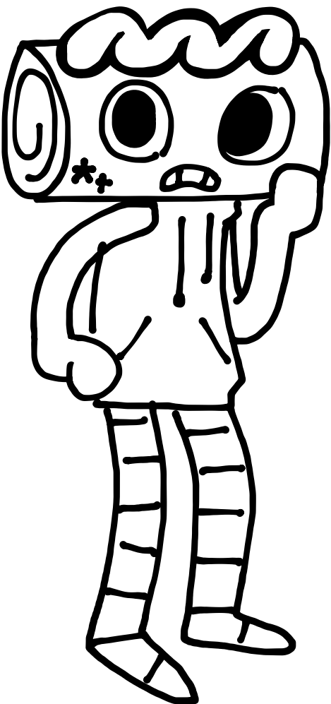
Cosmo -Dandy's World

I just don't like how he's popular for the wrong reasons lol, do I need to explain why the fandom ruined him for me?